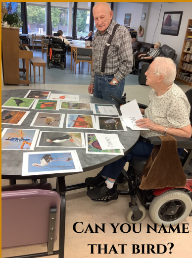
CAN YOU NAME THAT BIRD?