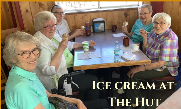
ICE CREAM AT THE HUT