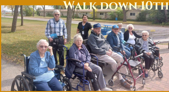
WALK DOWN 10TH