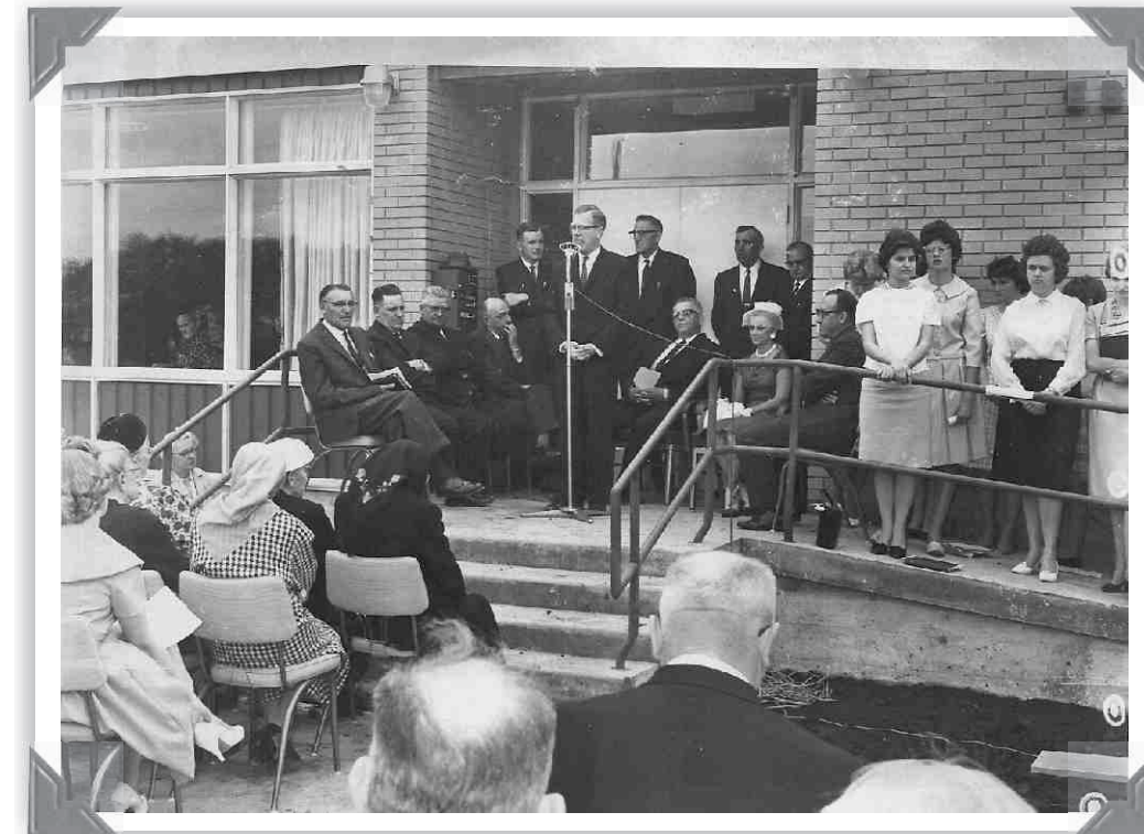
Official Opening of Ebenezer Home in 1962.

In 2011 the Board held invited church stakeholders to a workshop regarding the future. Here a strong mandate was received to build new facilities for the future – independent living with some meal service, and additional services like housekeeping and laundry available as requested. The result is The Gardens , begun in 2013 in fall and completed in Spring of 2015.